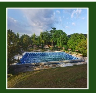
SWIMMING POOL LANDSCAPING AND CABANA